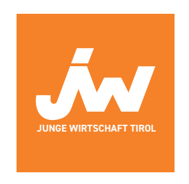
Junior Chamber Tyrol

The Youth Start European Entrepreneurship Award was organised by IFTE #Entrepreneurship4Youth together with the Rotary Club Kitzbühel and supported by numerous partners. All contributions from the sponsors go directly towards the event and the prizes for the young participants. We are proud to have the following co-hosts for the event: